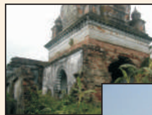
Jagat Seth's Mandir-Old ▲