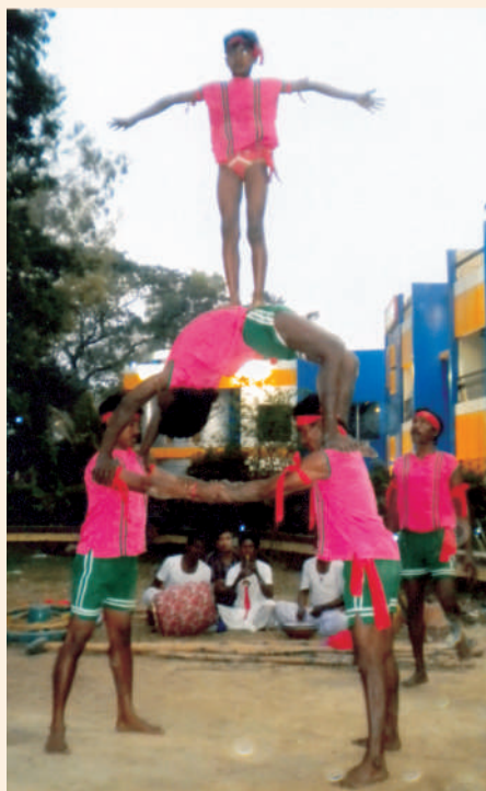
Cultural Programme organised for International guests by MHDS in Murshidabad.