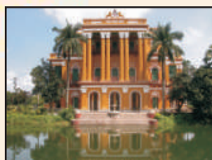
Katgola - New ►