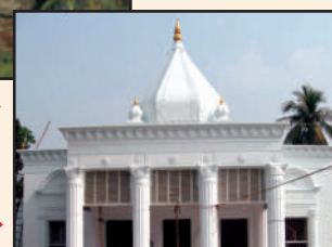
Jagat Seth's Mandir- New ►