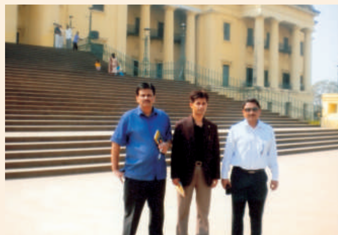
MHDS member with tour operators from Bangladesh

MHDS participated in CII's Tourism related 'DESTINATION EAST' at Kolkata in February. The stall, promoting Murshidabad as a destination for Heritage and Spiritual Tourism, evoked keen interest amongst the numerous visitors including International & National Tour Operators and Travel Writers. At the invitation of MHDS, a group of foreign delegates visited places of historical and architectural interest in Murshidabad. The Society organized a cultural function and sponsored their visit.