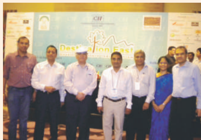
MHDS members at CII 'Destination East'