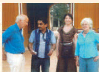
Architects & Curator with MHDS member at Katgola